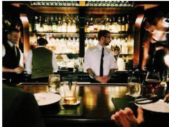
Bar Night Club